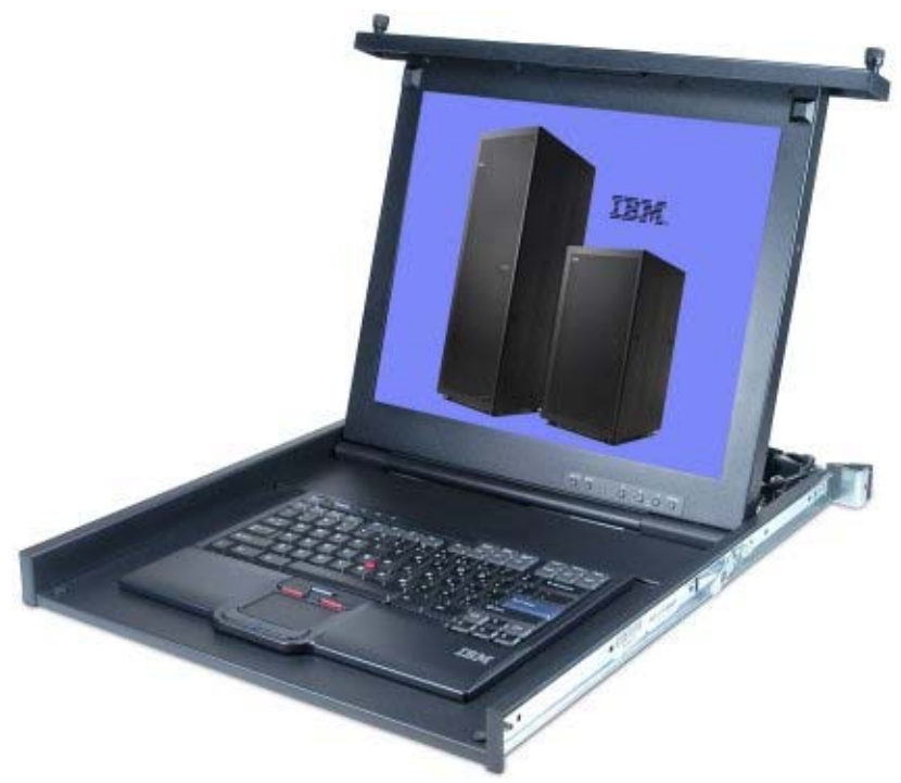
Figure 2. IBM 1U 17-inch Flat Panel Console Kit with the IBM UltraNav USB US English keyboard

Note : The console kits do not include a keyboard. See Table 2 for the supported USB keyboards and Table 3 for the supported PS/2 keyboards.